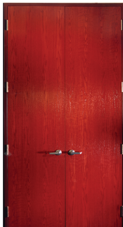
Wood Acoustic Door