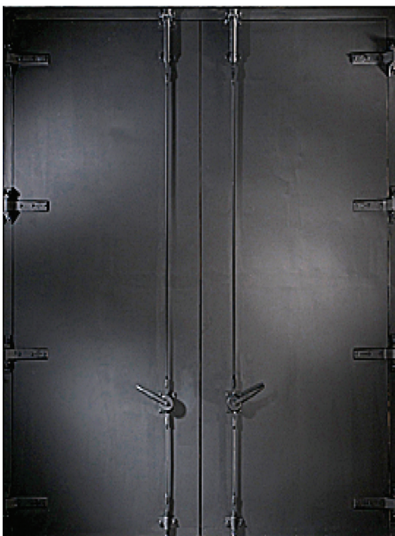
Steel Acoustic Door